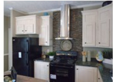
Madison Ave Floor plan number: ROC732100NC