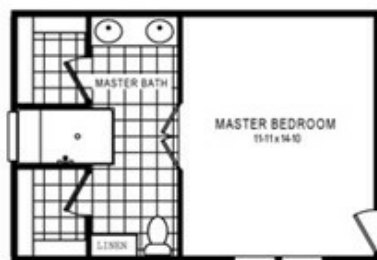
OPTIONAL MASTER BATH LAYOUT

Our home building facilities invest in continuous product and process improvements. Plans, dimensions, features, materials, specifications and availability are subject to change without notice or obligation. Renderings and floor plans are representative likenesses of our homes and may differ from the actual homes. We invite you to tour a Home Center near you and inspect the highest value in quality housing available or call (910) 796-8202 to speak with a Home Consultant. Copyright 2017, CMH. All rights reserved.